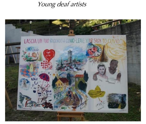
Great canvass painted at artists arrival