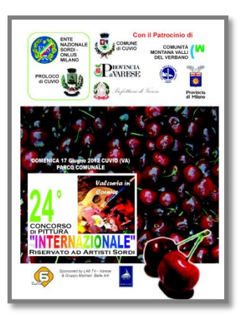
2012 participant catalogue